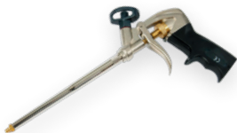
PU FOAM GUN