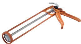
STANDARD AND HIGH POWER CARTRIDGE GUNS